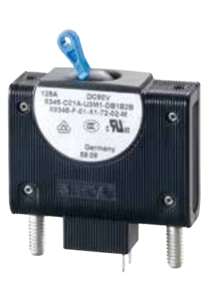
Hydraulic-Magnetic Circuit Breaker Type 8345 + X8345-F (remote trip module)