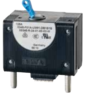
Hydraulic-Magnetic Circuit Breaker Type 8345 + X8345-R (remote ON/OFF actuation module)